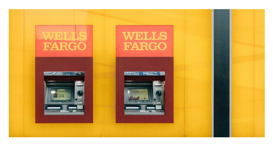
Self-service ticket machines